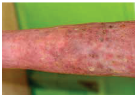
Figures 3,4 and 5.

Weindorf and Dissemond 10 discuss the challenges of debridement of painful chronic wounds in dermatological patients such as pyoderma gangrenous and epidermolysis bullosa. Debrisoft proved to be a useful, non-invasive and therefore safe alternative, especially for chronic wounds covered in fibrin and slough.