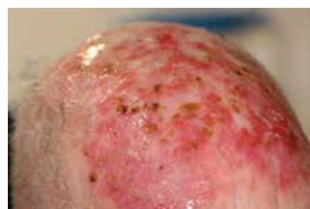
Figures 6 and 7.