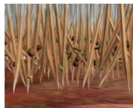
Figure 2. 18 million special monofilament fibres which have angled tips to reach uneven areas of the skin or wound bed™