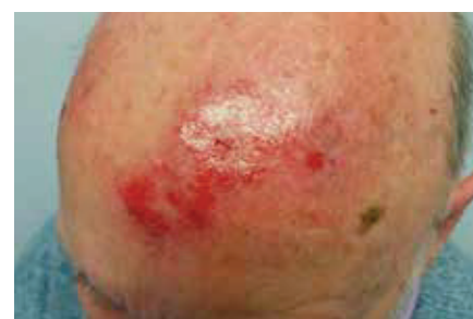
Figures 11 and 12.