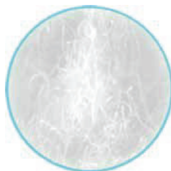
Figure 1. Monofilament Fibre Technology™

of the skin or wound bed (Figure 2) and will not damage new granulating tissue or epithelial cells.